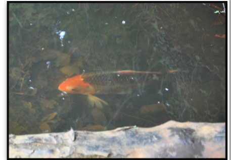
Koi Carp in the

It appeared to be happy swimming in and out, under the retaining wall of the bank. Even when a group of inquisitive Mallards came to see if food was on offer and churned the water into a murky soup: it still seemed to be happy.