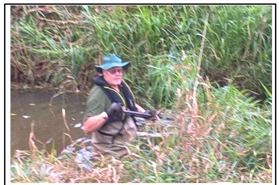
The EA clearing reeds from the channel

At last sighting they were working along Anglesey Avenue, towards Cheyne Way, This means that, at last, we can see water; mainly from the bridges, but clear water is visible and swans, ducks and moorhens can now swim freely up and down the Brook.