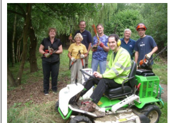
Work Party Volunteers from both groups