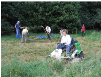
The ride-on mower