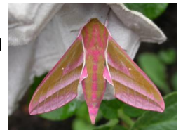
Elephant Hawk Moth

Stag beetles emerge in June along with the Poplar Hawk Moth, the Elephant Hawk Moth and the Hornet..