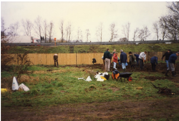
Clearing the area near Curly Bridge