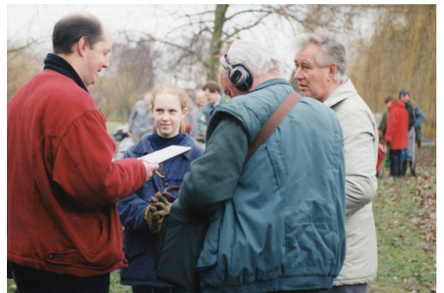
Local Radio interview