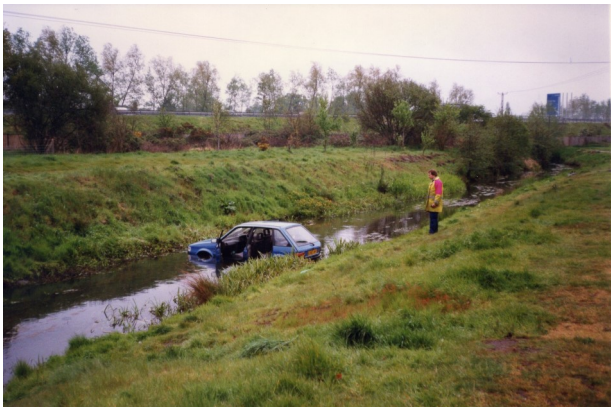
Who's car was this?

Details of where to send them are on the back page.