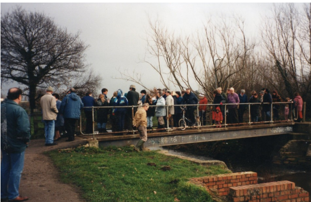
The inaugural walk

Since then a huge amount of work has been carried out by our wonderful volunteers. Some of our efforts are shown in the photographs below. If you recognise anyone in the photos or have more information about days gone by, we would love to hear from you