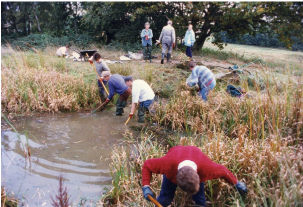
Renovating the pond at Cheyne Wood