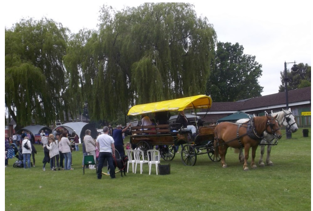
Family Fun Day at Blunden Green