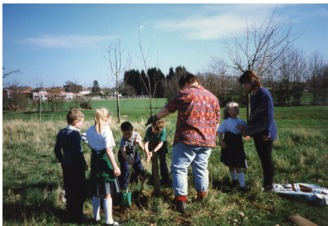
Moor Road School children planting saplings