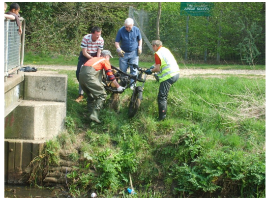
Removing motorcycle from the Brook