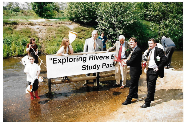
Launch of HCC River Study Pack